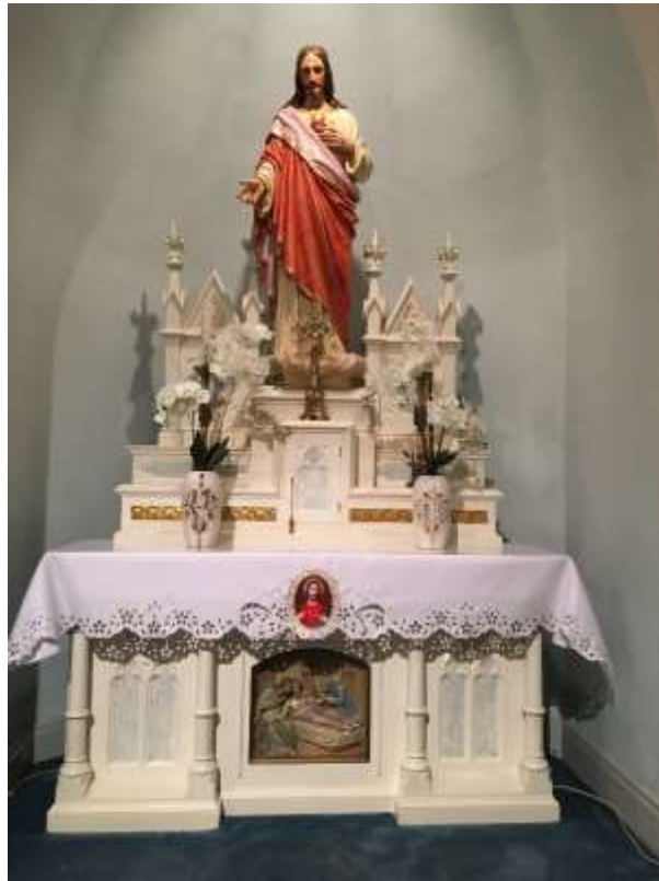
The Sacred Heart of Jesus